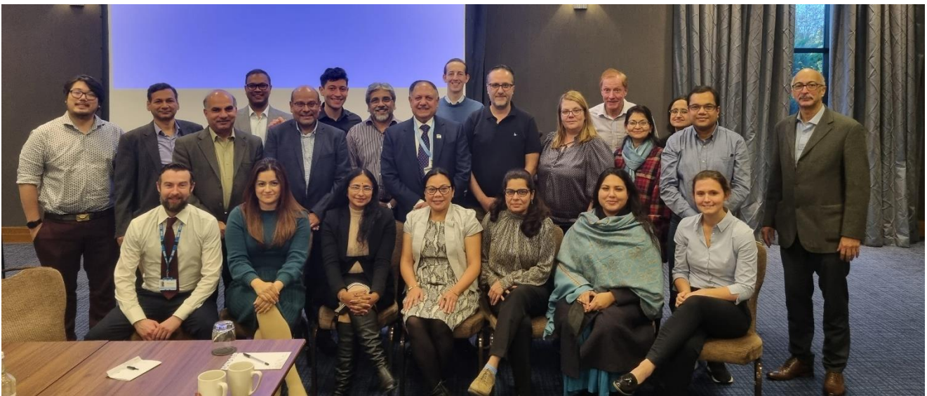
Photo from the SAS & LED Tutor Development Day, held on 14 November 2024

A huge thank you to all of our SAS & LE Doctors working within the east of England, and our SAS & LED Tutors and Medical Education Managers for the huge amount of work which goes into supporting them.