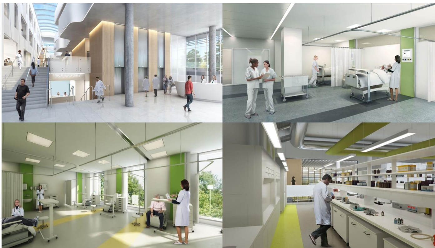
The Quadram Institute

A place on the Academic SFP offers the opportunity to spend protected time on academic research. At Norwich, this will be one four-month rotation during FY2. The remaining five rotations will be clinical attachments, during which clinical competencies must be met. Previous post holders have conducted basic research, epidemiological analysis, clinical trials, and systematic reviews across a number of disciplines.