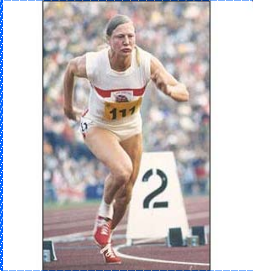
DAME MARY PETERS