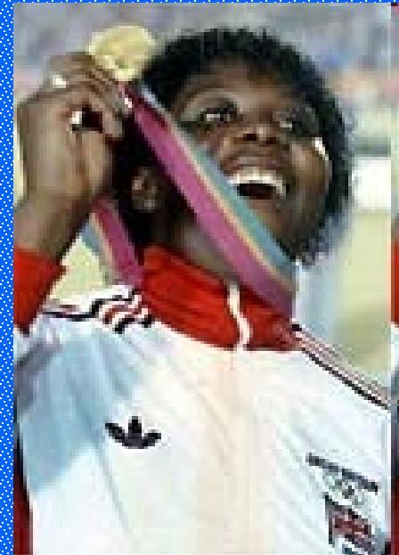
OLYMPIC GOLD 1984