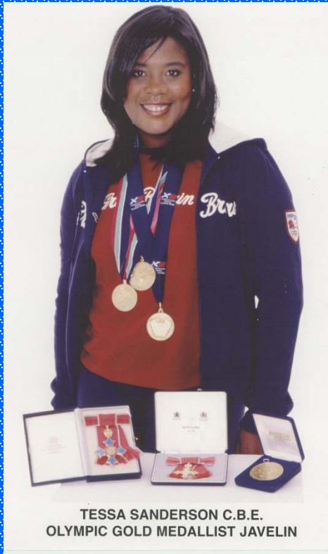
TESSA SANDERSON C.B.E. OLYMPIC GOLD MEDALLIST JAVELIN

CHASE YOUR DREAM AND FIND YOUR OWN GOLD MEDAL!